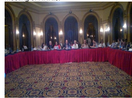
Workshop on Reproductive Rights Handbook