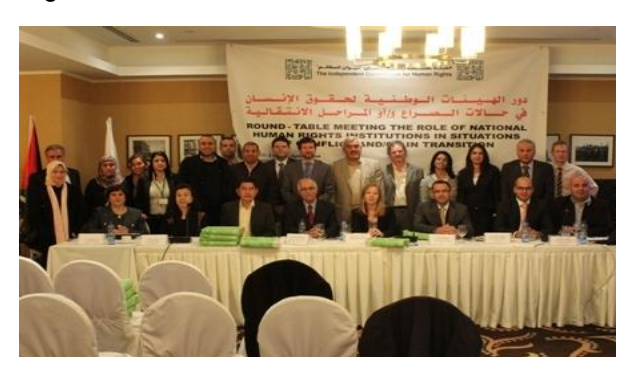
PICHR-hosted round-table on NHRIs' Role in Situations of Conflict and Transition

The roundtable was attended by the Geneva Representative of the UN International Coordinating Committee National of Institutions (ICC), and nine other representatives of four national institutions from Northern Ireland, Scotland, Thailand and Ecuador, representative of OHCHR in the occupied Palestinian territory. representatives of official Palestinian institutions, diplomatic missions, civil society organisations and the media.