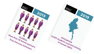
PROVEN TRACK RECORD